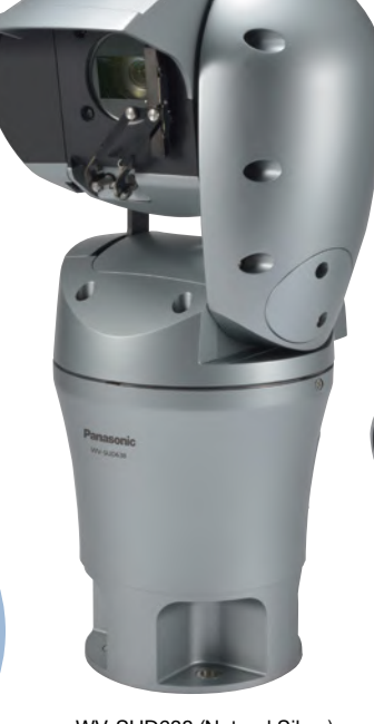
WV-SUD638 (Natural Silver) WV-SUD638-H (Gray) WV-SUD638-T (Brown)