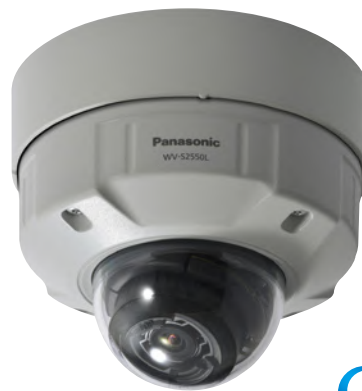
with Base Bracket