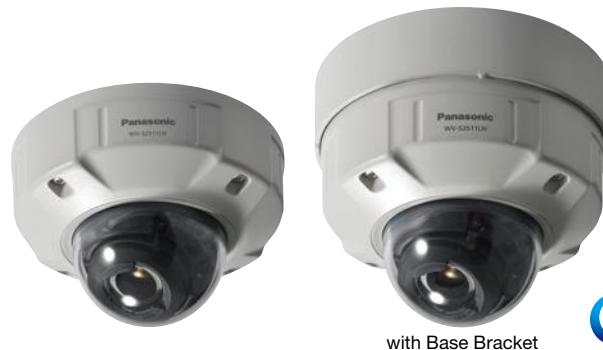
with Base Bracket