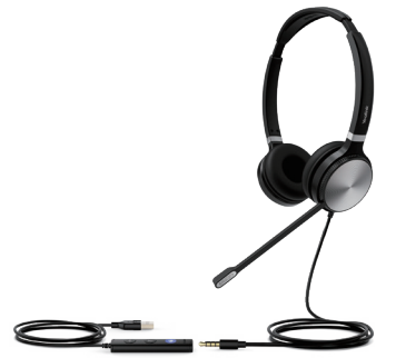
UH36 Dual Teams UH36 Dual UC