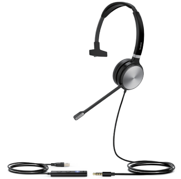
UH36 Mono Teams UH36 Mono UC

Deeply integrated with Yealink IP phones that the advanced features, such as volume synchronization and multiple calls control, are just right at your fingertips.