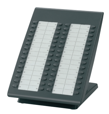
KX-NT305 Optional Module 60 Additional Programmable Key Module (KX-NT346 & NT343 only)