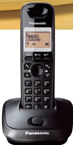
Titanium Black KX-TG2512CX