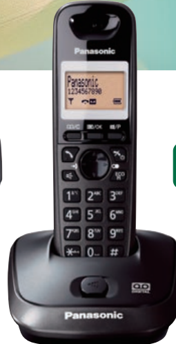
Titanium Black KX-TG2521CX