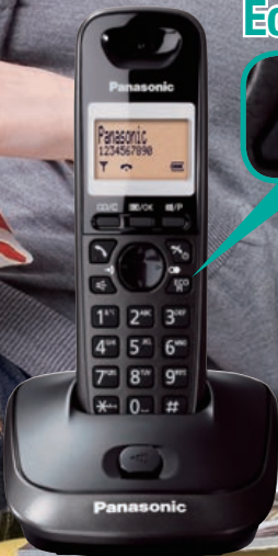
Titanium Black KX-TG2511CX

*Resource : MZA Ltd., 2008 Sales Figure from 2009 Market Share Analysis - Consumer Cordless http://www.mzaconsultants.com/